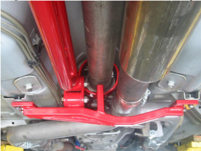
Image 4- Completed Installation