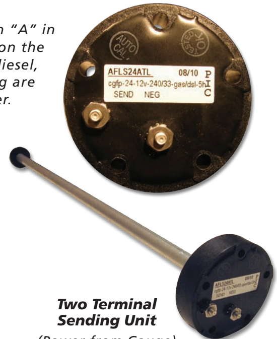
Two Terminal Sending Unit (Power from Gauge)

SEND: Connect this to the input terminal of your gauge or display. NOTE: The signal is an electronic output which will confuse your ohmmeter if you try to take a resistance reading between the sender and ground.