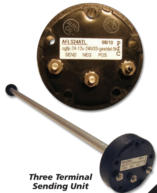
Three Terminal Sending Unit (Power from Ignition Switch)