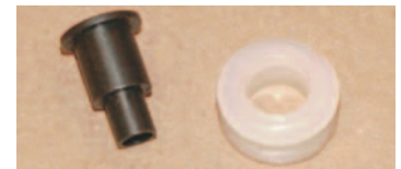
Photo #3: The roller and rivet kit P/N 36-150 includes two rollers and two tube rivets.