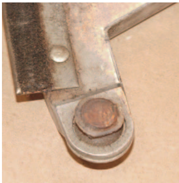
Photo #1: Here is a photo with normal wear on the original nylon roller.