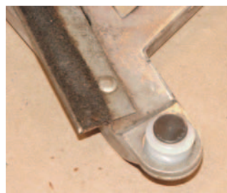
Photo #5: Be sure to apply some white lithium grease on the new rollers before installing the frame or regulator back into the car. This installation procedure may be used on window frames as well as regulators. Good Luck! ✓