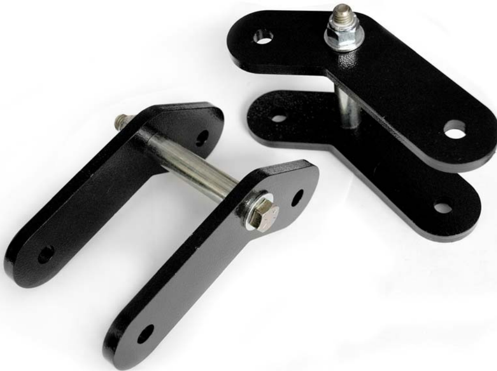
3/8" Heavy Duty Shackles Plates assembled with Grade 8 Hardware Included.

It is the ultimate buyers responsibility to have all bolts/nuts checked for tightness after the first 500 miles and then every 1000 miles. Wheel alignment, steering system, suspension, and driveline systems must be inspected by a qualified professional mechanic at least every 3000 miles