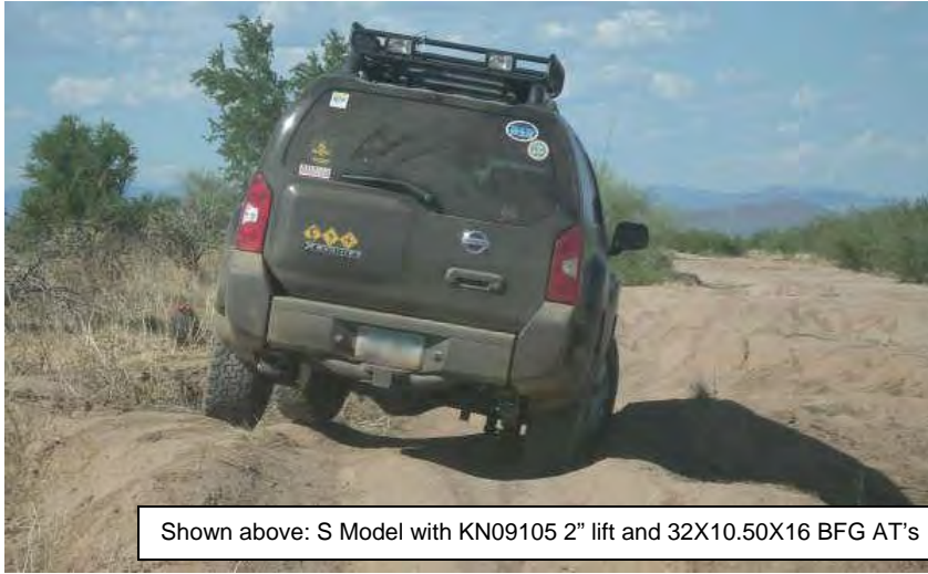
Shown above: S Model with KN09105 2" lift and 32X10.50X16 BFG AT's

841 South 71 st Avenue; Phoenix, AZ 85043