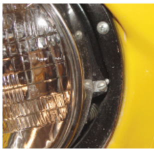
Photo #3: There is a stainless steel trim ring that surrounds the headlight bulb that holds the bulb in place. On a 1955 there are three screws that hold the trim ring to the headlight sub bucket. This assembly is then secured to the bucket with the adjusters and spring. On the 1956 and 1957 cars, the headlight trim ring snaps over the sub bucket and is held in place with one spring attached to the headlight bucket.