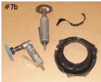
Photo #7a & 7b & 7c: The hole in the rear of the sub bucket measures 2-1/2". In order for the new Tri-Bar bulb to fit, it will need to be enlarged to 3-1/2". Using a cut-off wheel or jig saw, trim the rear lip of the sub bucket.