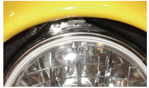
Photo #8: Install the sub bucket back into the headlight assembly and install the headlight and trim ring. The Tri-Bar halogen bulb will plug into the stock wiring harness. The headlight is marked "TOP", so when the headlight is installed the "TOP" mark should be at 12:00 o'clock. If you did not disturb the headlight adjuster screws, you should not need to adjust the headlights. If your lights were out of adjustment, be sure to adjust them (at night using your garage door as a target works well) as needed.

Now the Tri-Bar headlight will fit the sub bucket perfectly.