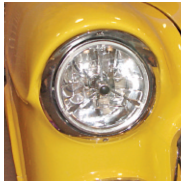
Photo #9: Last, install the headlight bezel. There is no comparison between the new Tri-Bar headlights and the replacement sealed beam headlights. The Tri-Bar headlights really give the front end of the car a custom look and will help you see better when driving at night! Good Luck. ✓