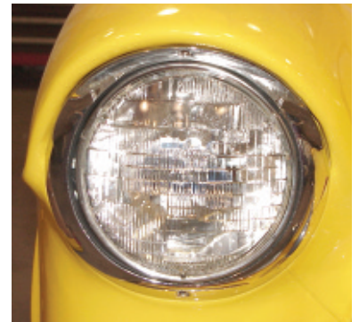
Photo #2: To change the headlight, first the headlight bezel must be removed. The 1955 headlight bezel is held to the headlight bucket with two #6 counter sunk sheet metal screws located at 6:00 and 12:00 o'clock.