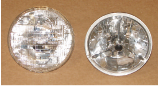
Photo #5: The Tri-Bar H-4 halogen headlights are available with a clear, black, red or blue center dot. We are installing the P/N 28-67 headlights with the black dot. These will really give the front of our 1955 a super custom look versus the replacement sealed beam light bulbs. You can choose the color dot that you think will best complement your paint scheme.

Photo #4a & 4b: To remove the headlight bulb, ring and sub bucket assembly, simply pull forward on the retaining spring that is hooked into the stainless ring and disengage the ring from the adjuster screws. If your retaining spring is hooked directly to the sub bucket, remove the three screws and the headlight bulb can be removed from the sub bucket.