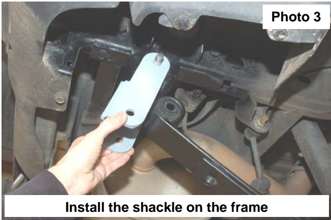
Install the shackle on the frame