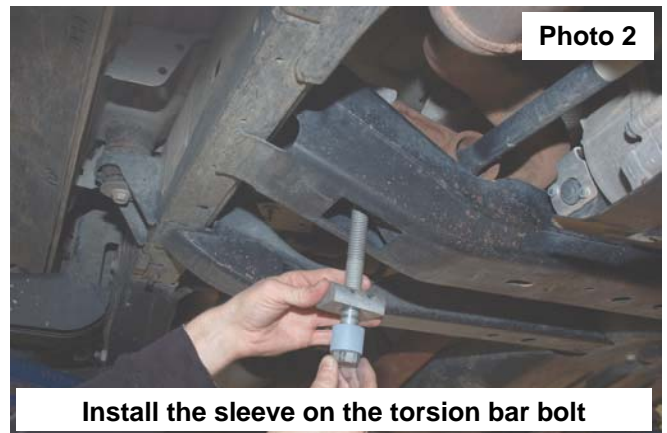
Install the sleeve on the torsion bar bolt