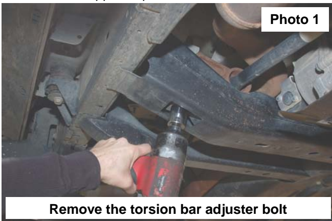
Remove the torsion bar adjuster bolt