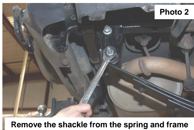
Remove the shackle from the spring and frame