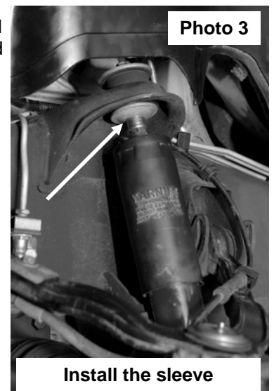
Install the sleeve