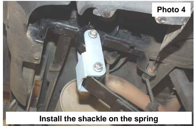
Install the shackle on the spring