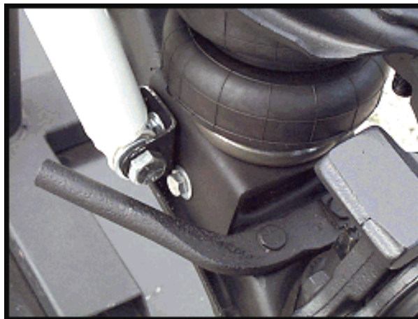
Mustang II with OEM lower a-arm